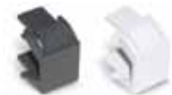
Blank covers, black and white