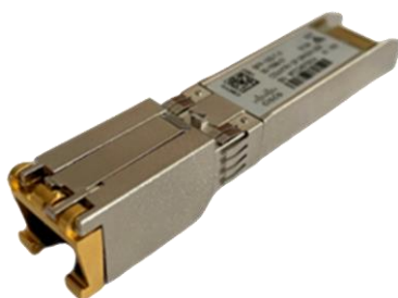
Figure 2. Cisco SFP+ 10GBASE-T module with RJ-45 connector

The Cisco 10GBASE-T module (Figure 2) offers connectivity options at the following data rates: 100M/1G/10Gbps. It has the SFP+ form factor and an RJ-45 interface so that CAT5e/CAT6A/CAT7 cables can be used to connect to end points with embedded 10GBASE-T ports. They are suitable for distances up to 30 meters and offers a cost-effective way to connect within racks and across adjacent racks.