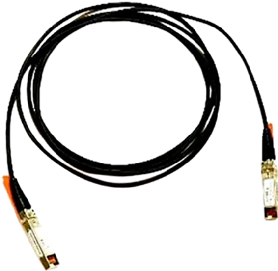
Figure 4. Cisco direct-attach twinax copper cable assembly with SFP+ connectors

Cisco SFP+ Copper Twinax (Figure 4) direct-attach cables are suitable for very short distances and offer a cost-effective way to connect within racks and across adjacent racks. Cisco offers passive Twinax cables in lengths of 1, 1.5, 2, 2.5, 3, 4 and 5 meters, and active Twinax cables in lengths of 7 and 10 meters.