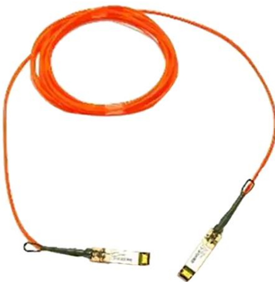
Figure 5. Cisco direct-attach active optical cables with SFP+ connectors

Cisco SFP+ Active Optical Cables (Figure 5) are direct-attach fiber assemblies with SFP+ connectors. They are suitable for very short distances and offer a cost-effective way to connect within racks and across adjacent racks. Cisco offers Active Optical Cables in lengths of 1, 2, 3, 5, 7, and 10 meters.