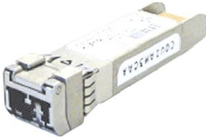
Figure 1. Cisco 10GBASE SFP+ modules

The Cisco® 10GBASE SFP+ modules (Figure 1) give you a wide variety of 10 Gigabit Ethernet connectivity options for data center, enterprise wiring closet, and service provider transport applications.