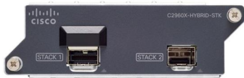
Figure 6. Cisco FlexStack-Extended: Hybrid module