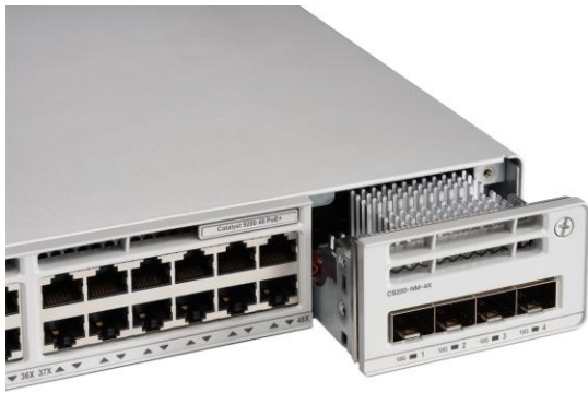
Figure 3. Cisco Catalyst 9200 Series Switch dual redundant power supplies

Table 3 lists the PoE+ power availability for each model.