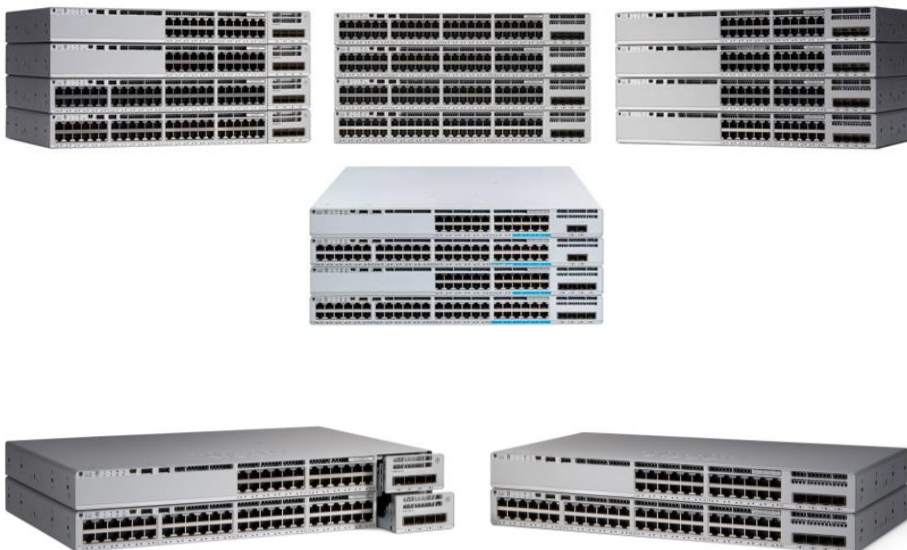
Figure 1. Cisco Catalyst 9200 Series switches

The Cisco Catalyst 9200 Series is made up of modular (C9200) and fixed (C9200L) switch models.