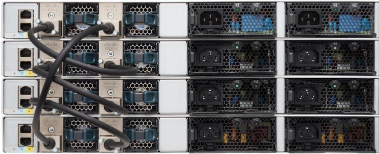
Figure 4. Cisco Catalyst 9200 Series Switch stacked units