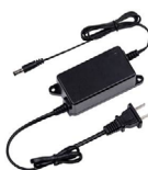
DC12V/2A Power Adapter