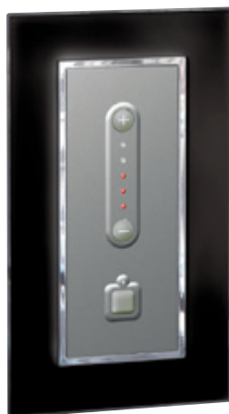
5 727 41