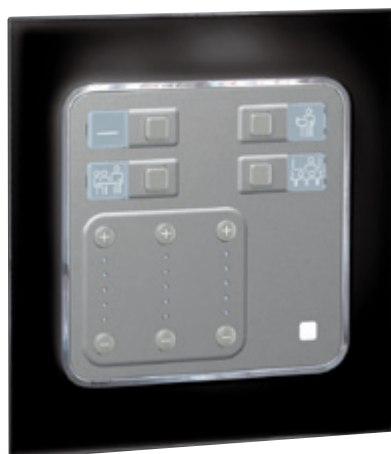
5 740 60

Support frame and plate selection charts p. 414-421 Load selection charts p. 389