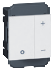
5 722 11