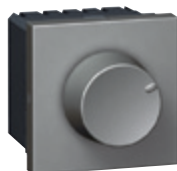
5 727 13